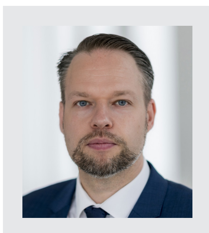
Dear Reader, Welcome to the latest edition of our Sustainable Finance Bulletin.

The role of the financial sector in transforming our economy and society towards sustainability had been overlooked for too long. Fortunately, capital markets have started to take the right path to support this transformation. Some years ago, sustainable finance used to be a small niche. But today it is becoming a transformational force.